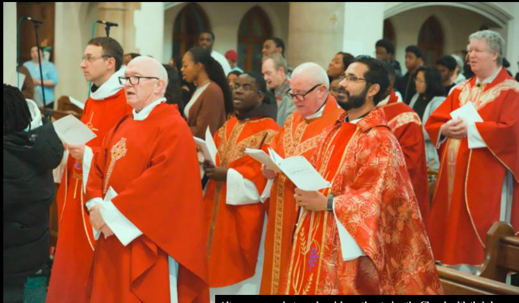
Altar servers, priests, and parish youth entering the Church with their banners!

“HUNDREDS OF YOUNG PEOPLE FROM ACROSS NEWHAM FILLED ST ANTONY'S CHURCH”