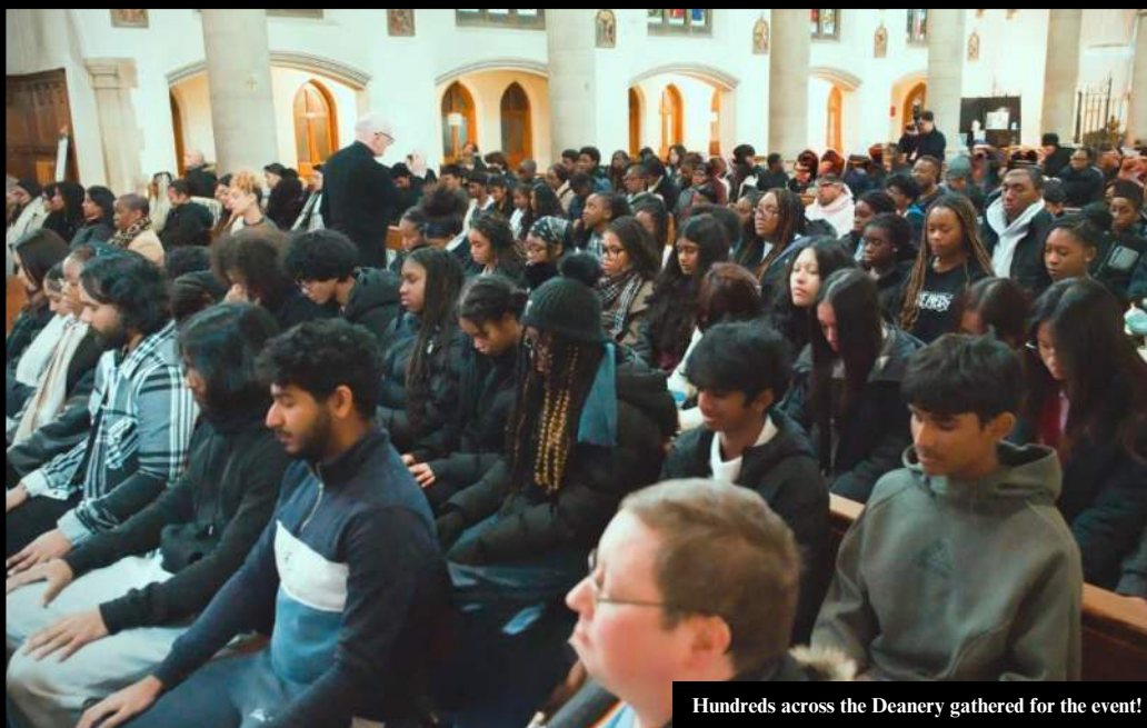
Hundreds across the Deanery gathered for the event!

FAITH, PERFORMANCE AND YOUTH LEADERSHIP SHINE AT ST ANTONY'S