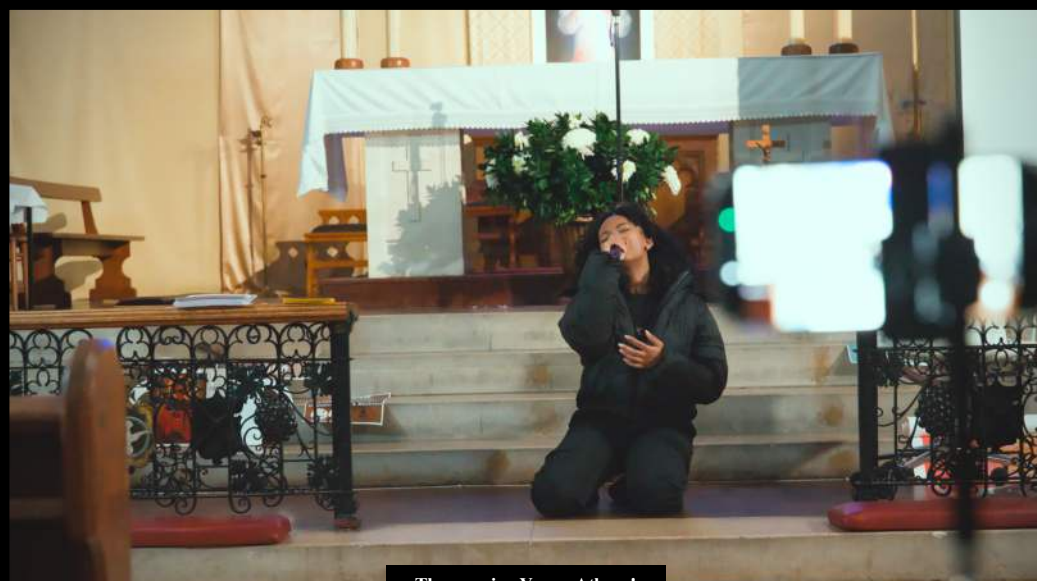
The amazing Young Athena!