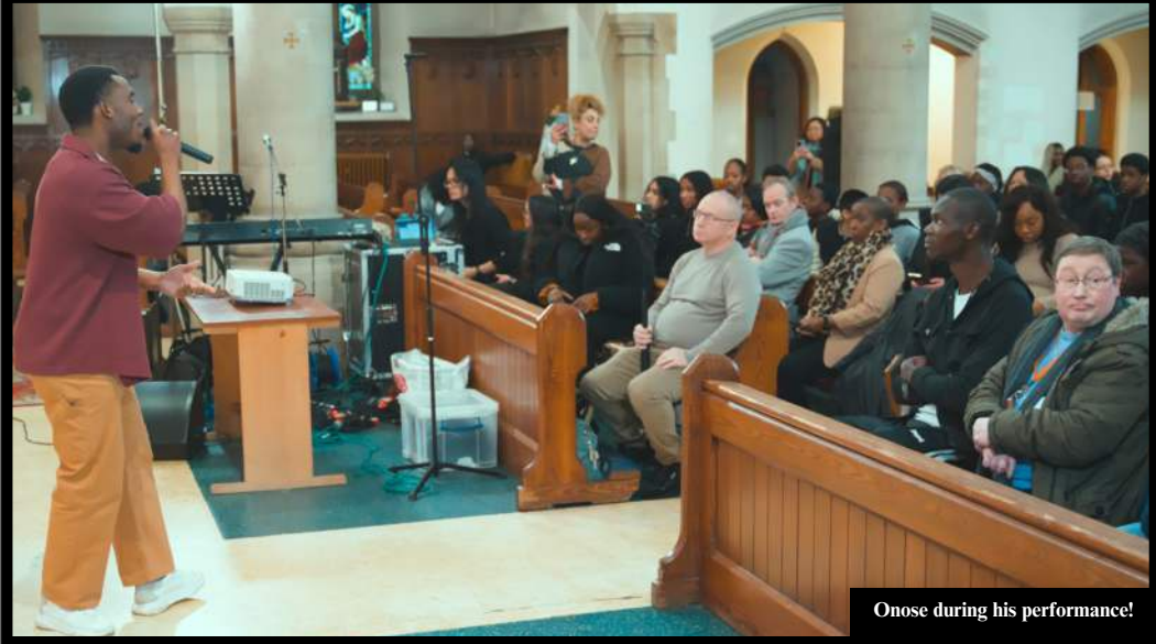
Onose during his performance!