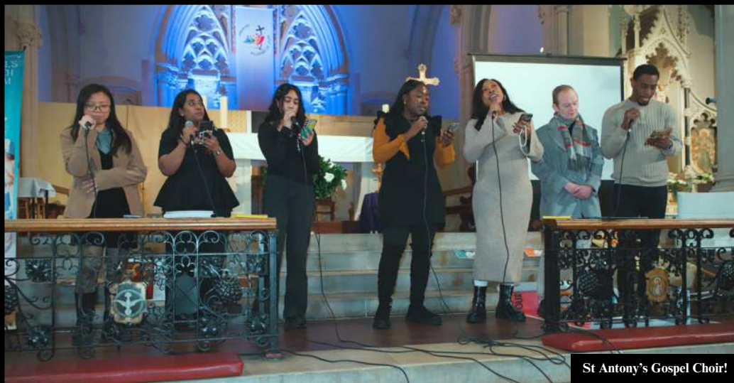
St Antony's Gospel Choir!

"THE DAY CAPTURED THE FAITH, TALENT AND HOPE OF NEWHAM'S YOUTH"