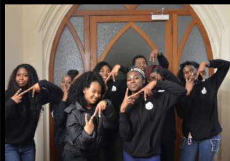
Young Athena with NDYsing Choir!