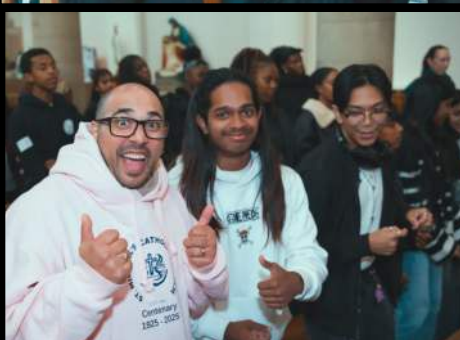
All smiles in the Church!