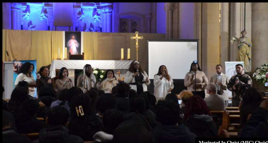
Marinated In Christ (MIC) Choir!