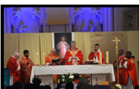
Parish Priests from across the Deanery, took part in the Mass!