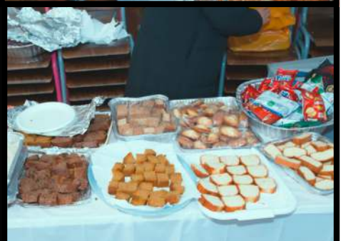
All the amazing food and refreshments provided!